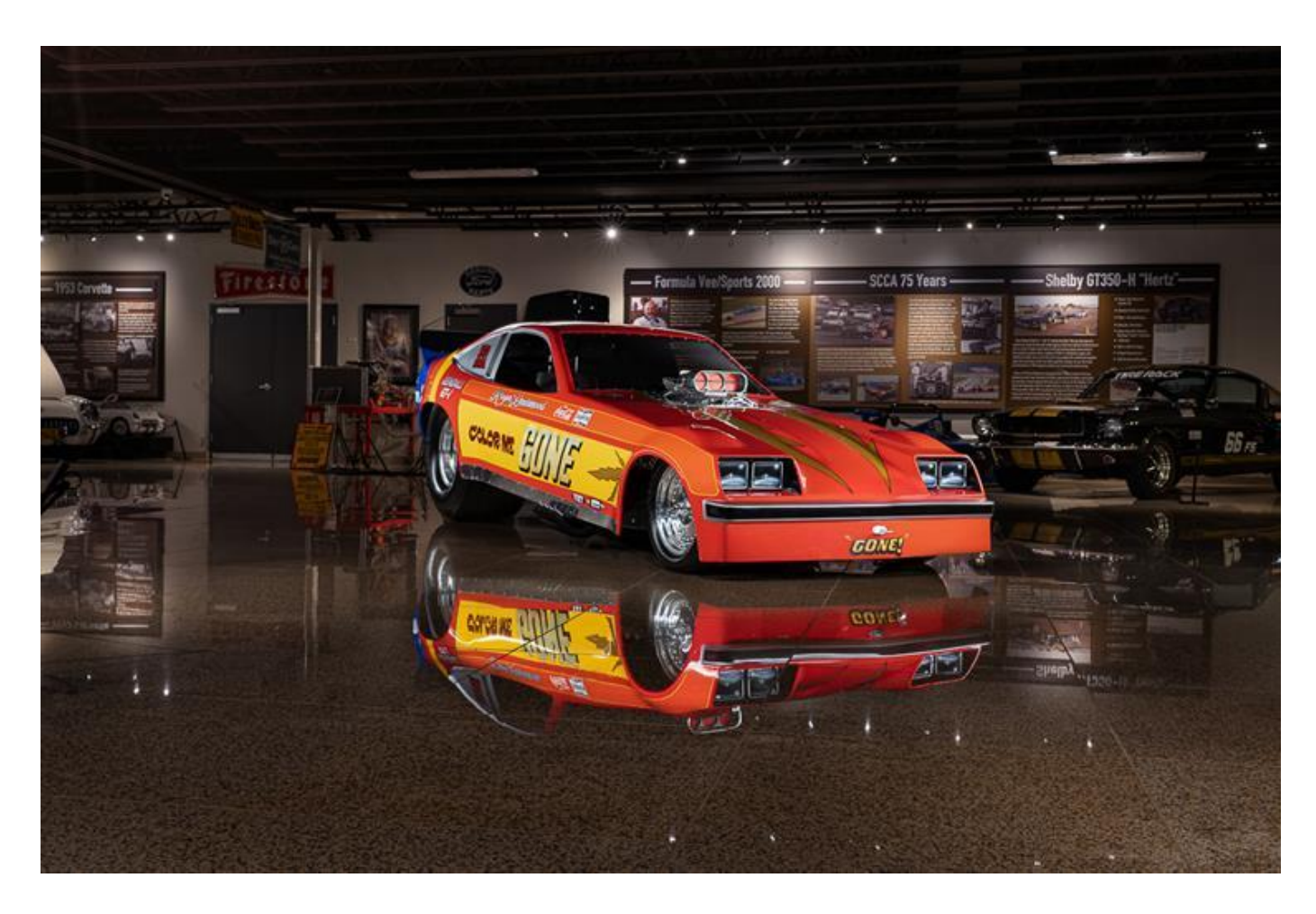
This is a picture from the Museum of American Speed in Lincoln, NE. A large SCCA display is in the background